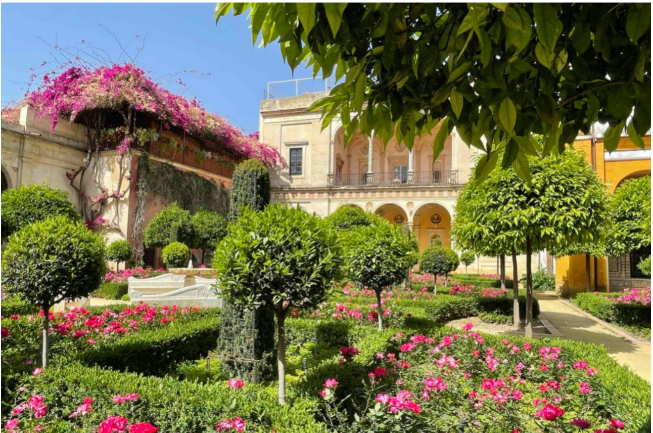
Vivid hues in a garden at the Casa de Pilatos, Seville, Spain.

Photos and other images in this issue come from the following sources (with thanks): Page 2: www.piqsels.com (public domain); Pages 4 & 9: Liz Matthews; Page 7: www.rawpixel.com (public domain); Page 8: Sally Reynolds.