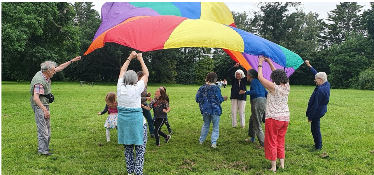
All-age fun at Waterperry Gardens in July 2021.

Woodbrooke is currently running weekly sessions on preparing for Quaker Week 2022, which may be of interest to Friends regardless of any activities in which we may engage as a Meeting. For further information, visit https://www.woodbrooke.org.uk/product/preparing-for-quaker-week-2022/ (alternatively, navigate to the course from the Woodbrooke Home page at https://www.woodbrooke.org ).