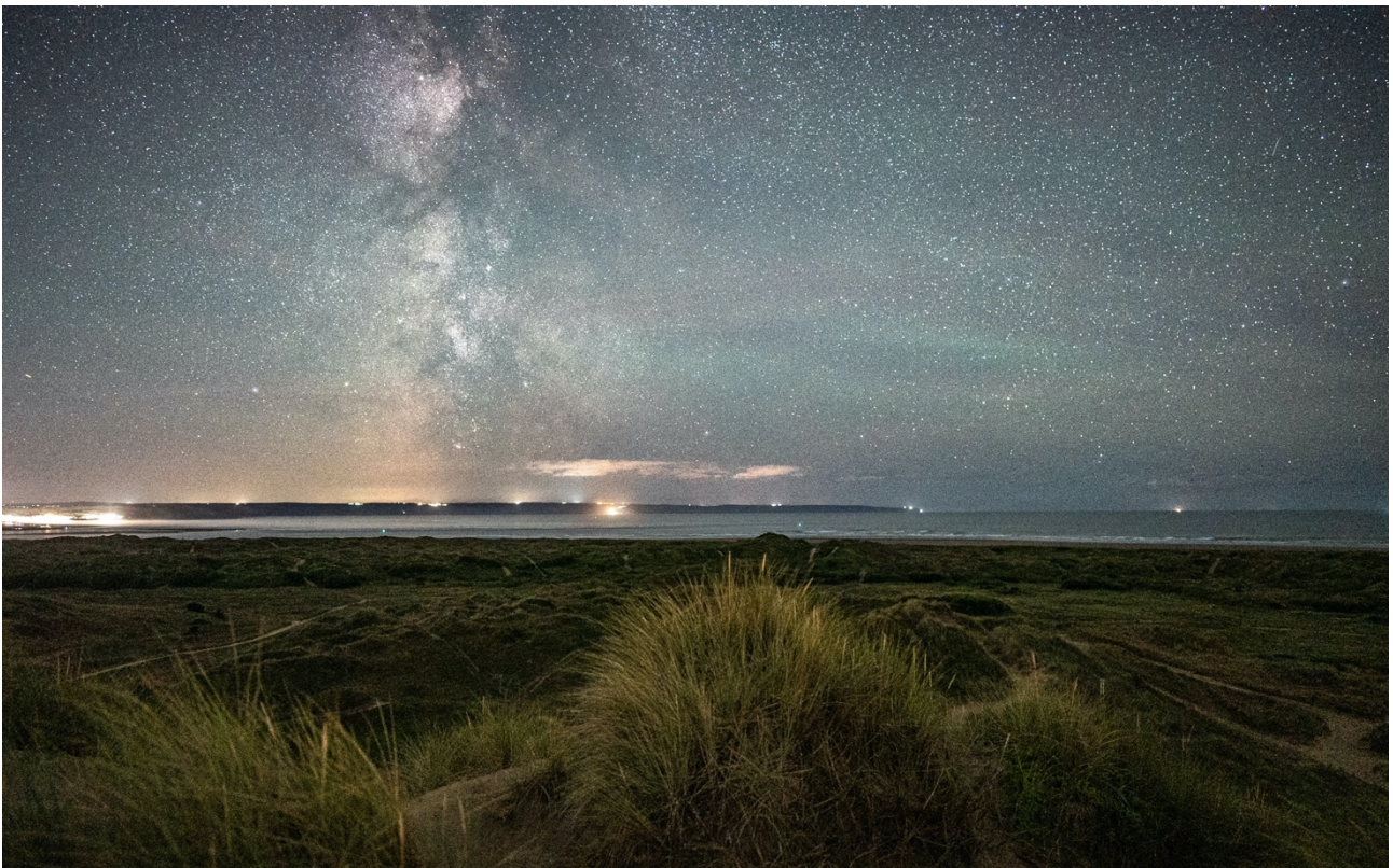
Night sky with the Milky Way seen from Braunton Burrows, Devon, on 26 th July.

The publication date of the newsletter lies between the 28 th and the last day of the month. The September issue is due for publication on Sunday 28 th August . Please send your contributions (in words and/or pictures) to the editors by Thursday 25 th August . Although we don't set a word limit, we may make judicious edits for length and/or readability.